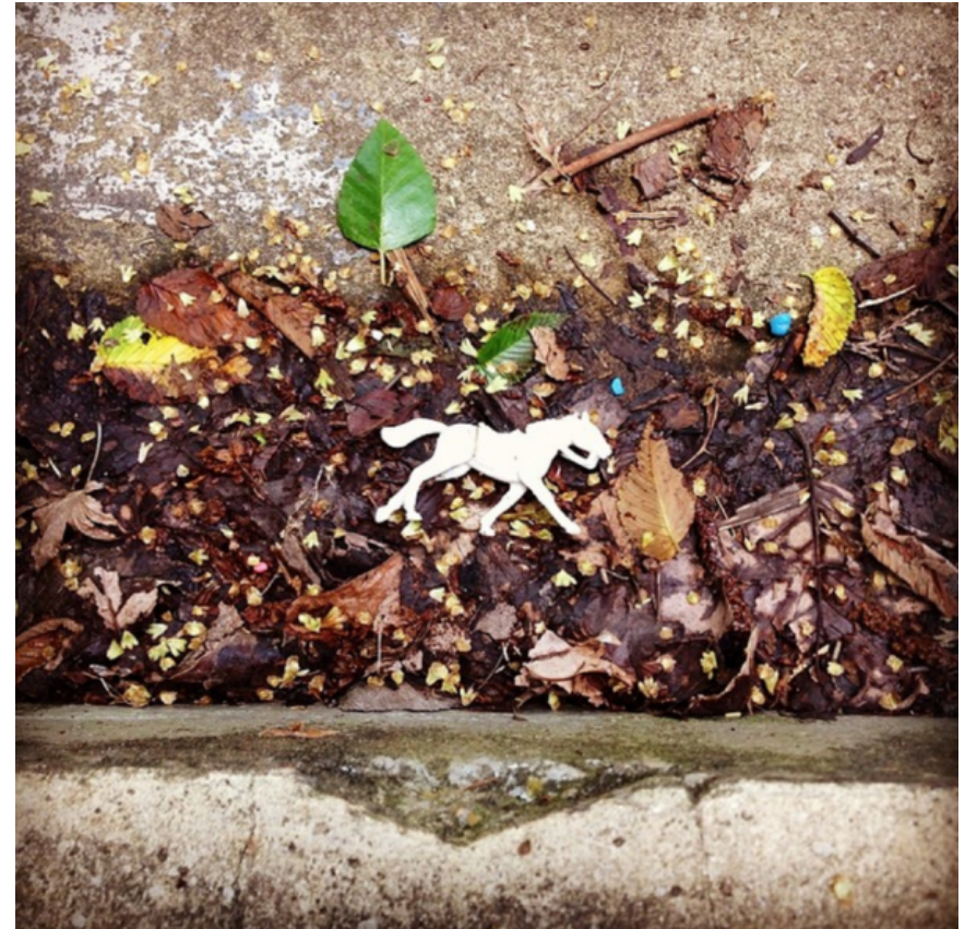
A WHITE MARE WAITS.